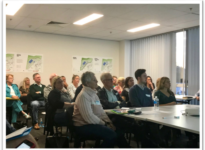
Panel members taking in the masterplan presentation

Groups were assigned 15 minutes for each topic. To facilitate genuine feedback and two-way discussion, members responded to the plans, set up as three stations across the room, by placing sticky notes on large printouts of the plans. A project team member was assigned as a facilitator for each station to provide information, respond to questions and guide discussion.