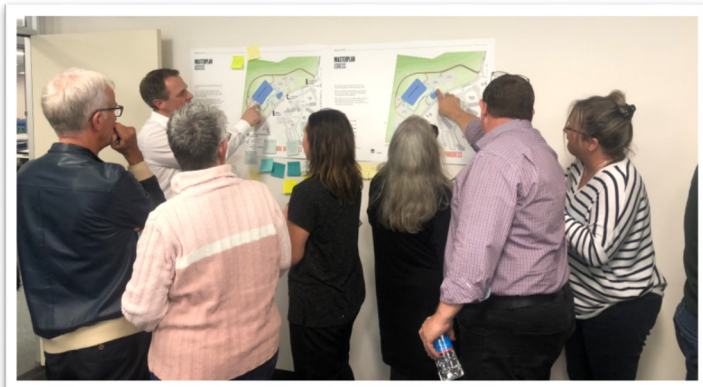
Panel members give their feedback on draft masterplan drawings