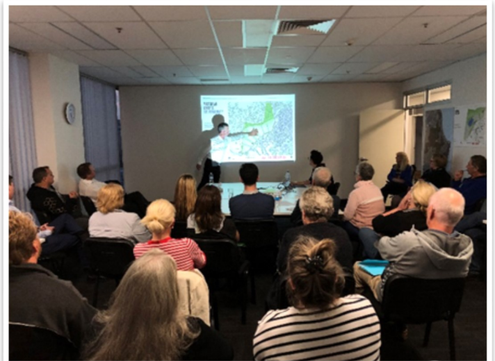
Masterplan presentation by the project architects

The masterplan is due for public exhibition in late 2018 as part of the planning approval process.