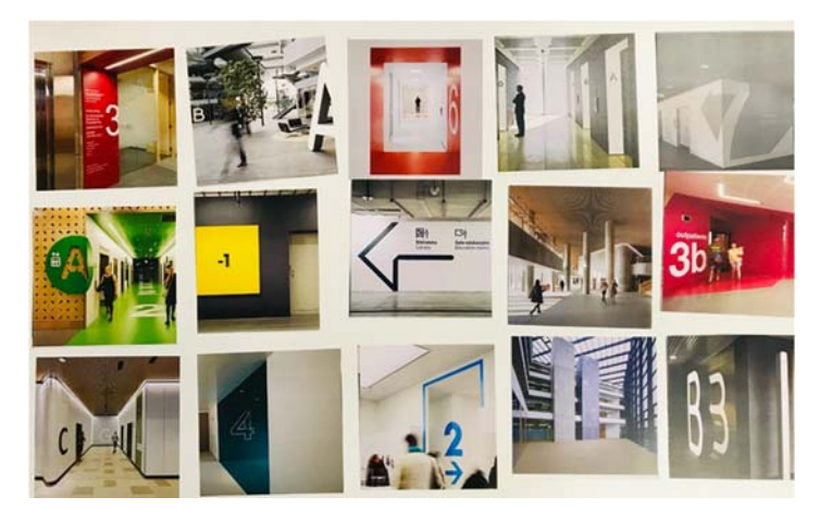
A selection of wayfinding images that appealed to Panel members