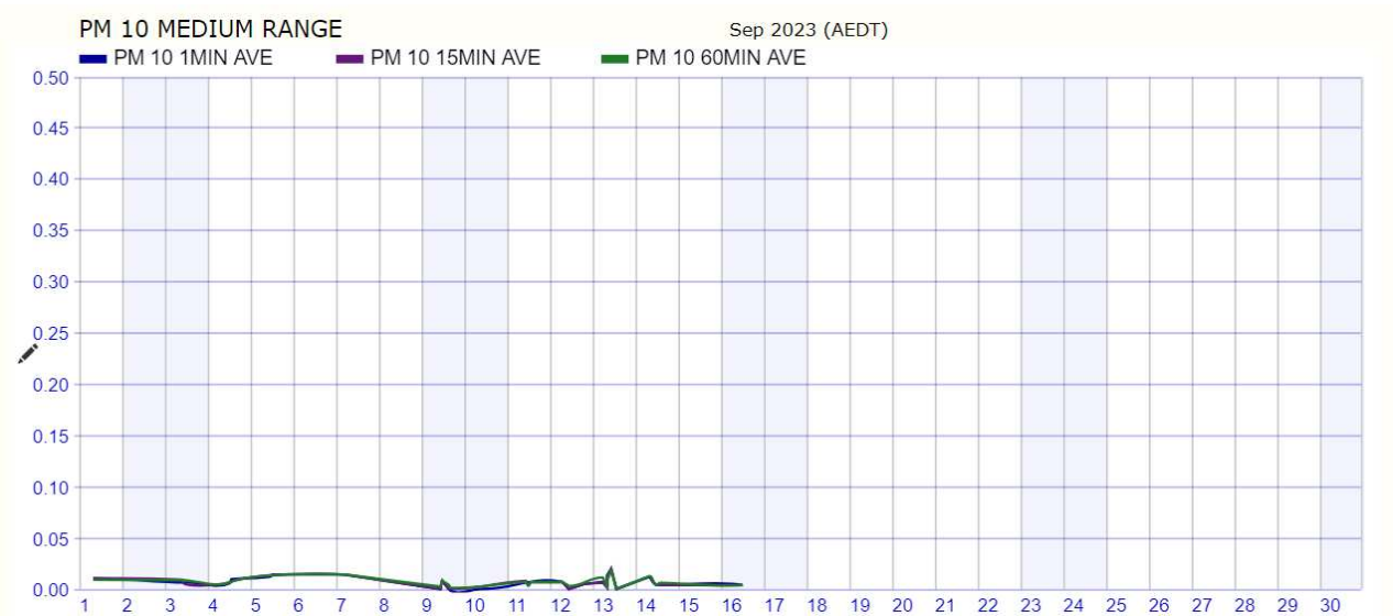
Figure 2. Summary of PM10 from the real time monitoring at location 006 – Mate and Matts for the month of September 2023.