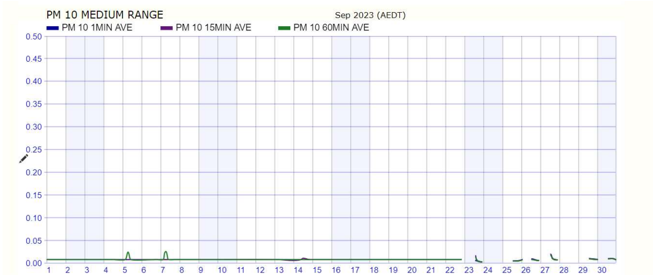
Figure 1. Summary of PM10 from the real time monitoring at location 005 – Solar Industry for the month of September 2023.

Figures below show monthly dust results for each of the three (3) monitoring locations. All graphs below express dust levels as an hourly average and values <0.001 \text{ mg/m}^3 will be recorded as 0 \text{ mg/m}^3 and will not be graphed.