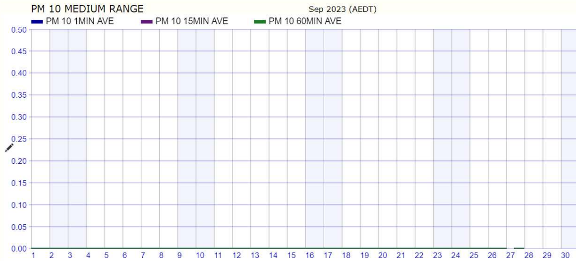
Figure 3. Summary of PM10 from the real time monitoring at location 007 – Residential for the month of September 2023.