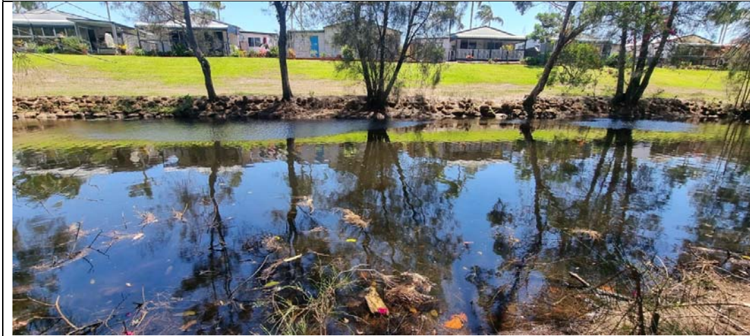
Site 002 – North-west Creek (Upstream) (16/10/2023)