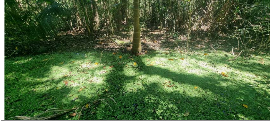
Site 005 – Dam Drain (Downstream) (16/10/2023)