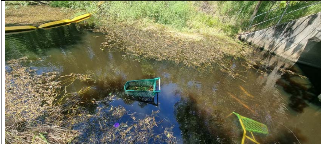
Site 003 – East Creek (Upstream) (16/10/2023)