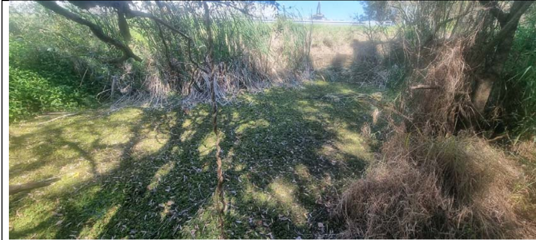
Site 001 – West Creek (Downstream) (16/10/2023)