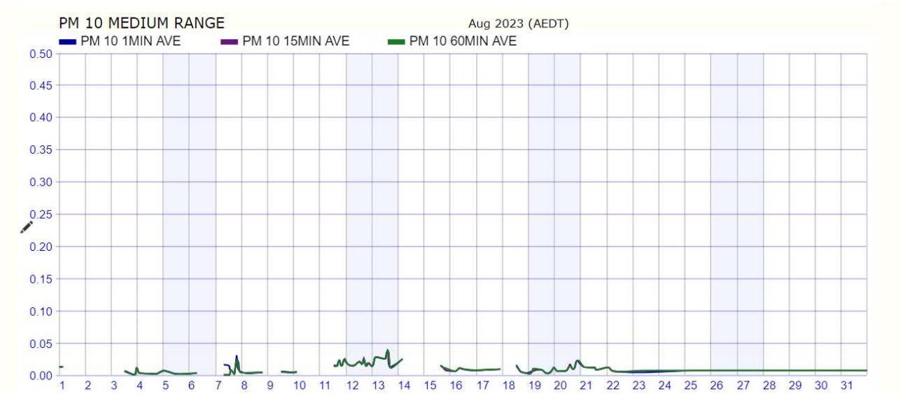
Figure 1. Summary of PM10 from the real time monitoring at location 005 – Solar Industry for the month of August 2023.

Figures below show monthly dust results for each of the three (3) monitoring locations. All graphs below express dust levels as an hourly average and values <0.001 \text{ mg/m}^3 will be recorded as 0 \text{ mg/m}^3 and will not be graphed.