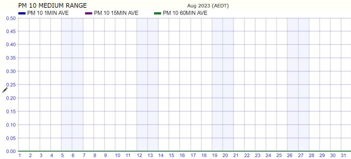
Figure 3. Summary of PM10 from the real time monitoring at location 007 – Residential for the month of August 2023.