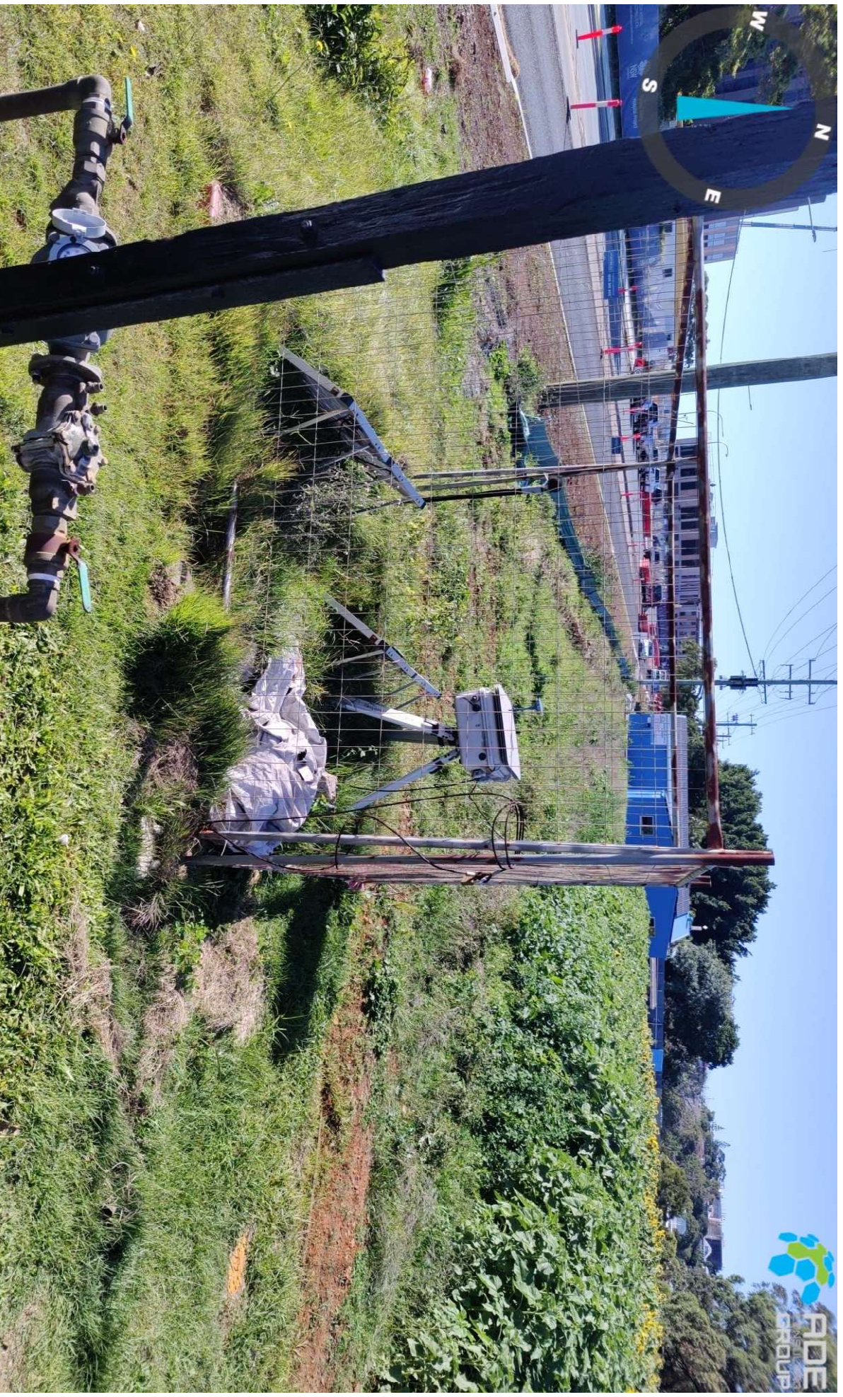
Photograph 2: Representative photograph of monitoring location 006 – Mate and Matts, as observed 12/06/2023