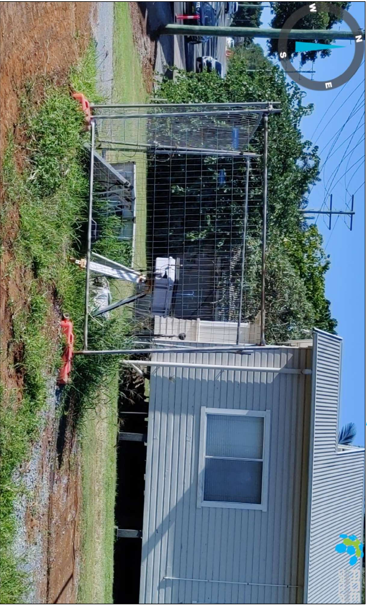
Photograph 3: Representative photograph of monitoring location 007 – Residential, as observed 12/06/2023