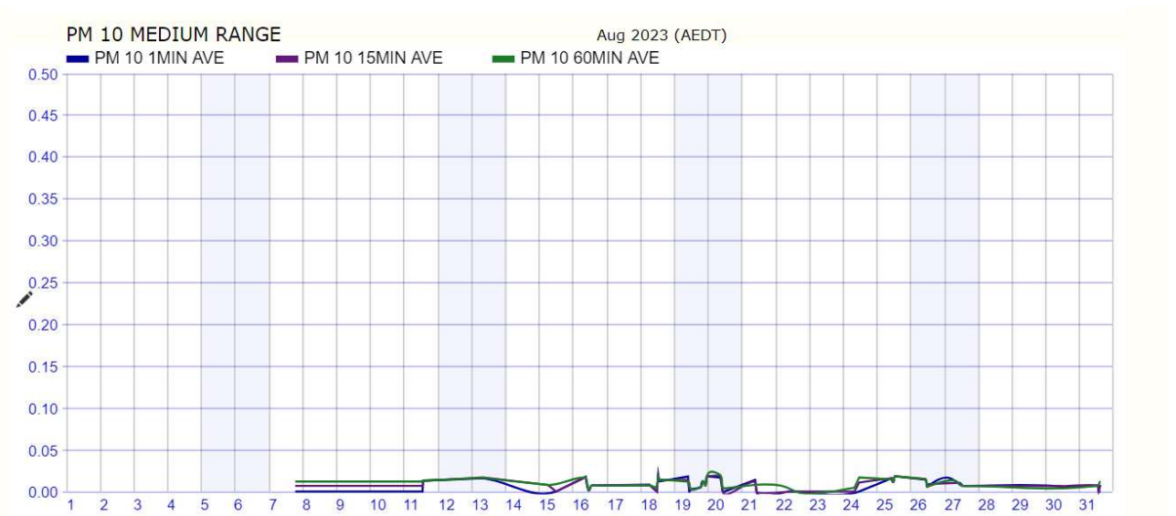
Figure 2. Summary of PM10 from the real time monitoring at location 006 – Mate and Matts for the month of August 2023.