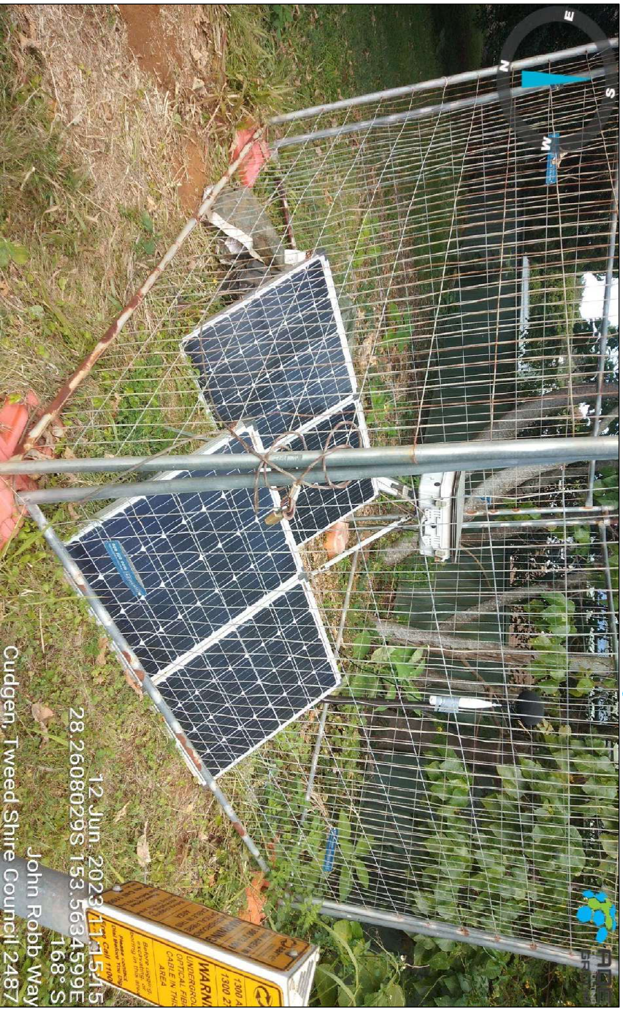
Photograph 1: Representative photograph of monitoring location 005 – Solar Industry, as observed 12/06/2023