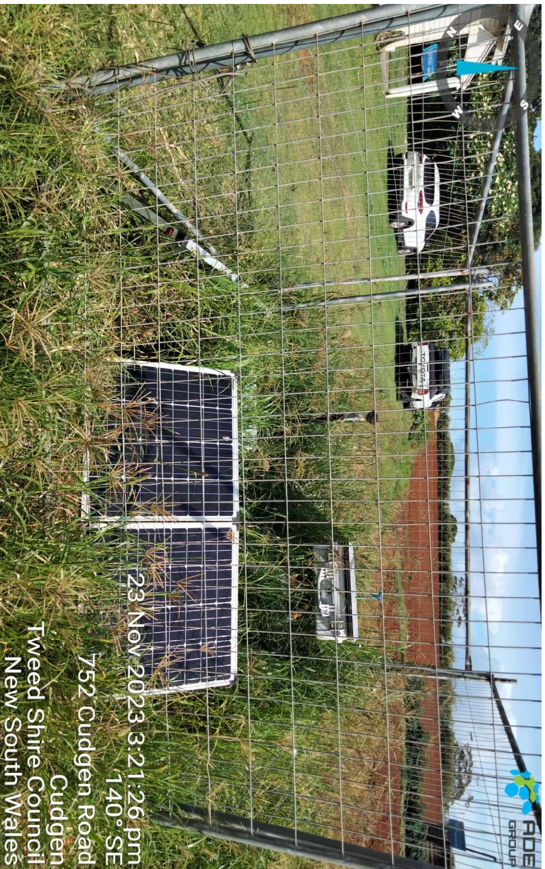
Photograph 3: Representative photograph of monitoring location 007 – Residential, as observed 23/11/2023

23 Nov 2023 3:21:26 pm 140° SE 752 Cudgen Road Cudgen Tweed Shire Council New South Wales