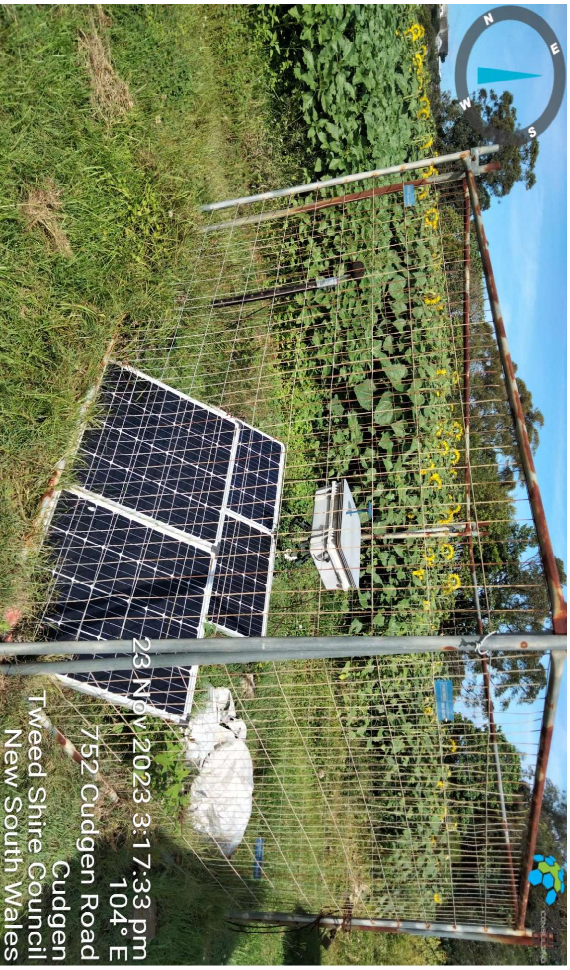
Photograph 2: Representative photograph of monitoring location 006 – Mate and Matts, as observed 23/11/2023