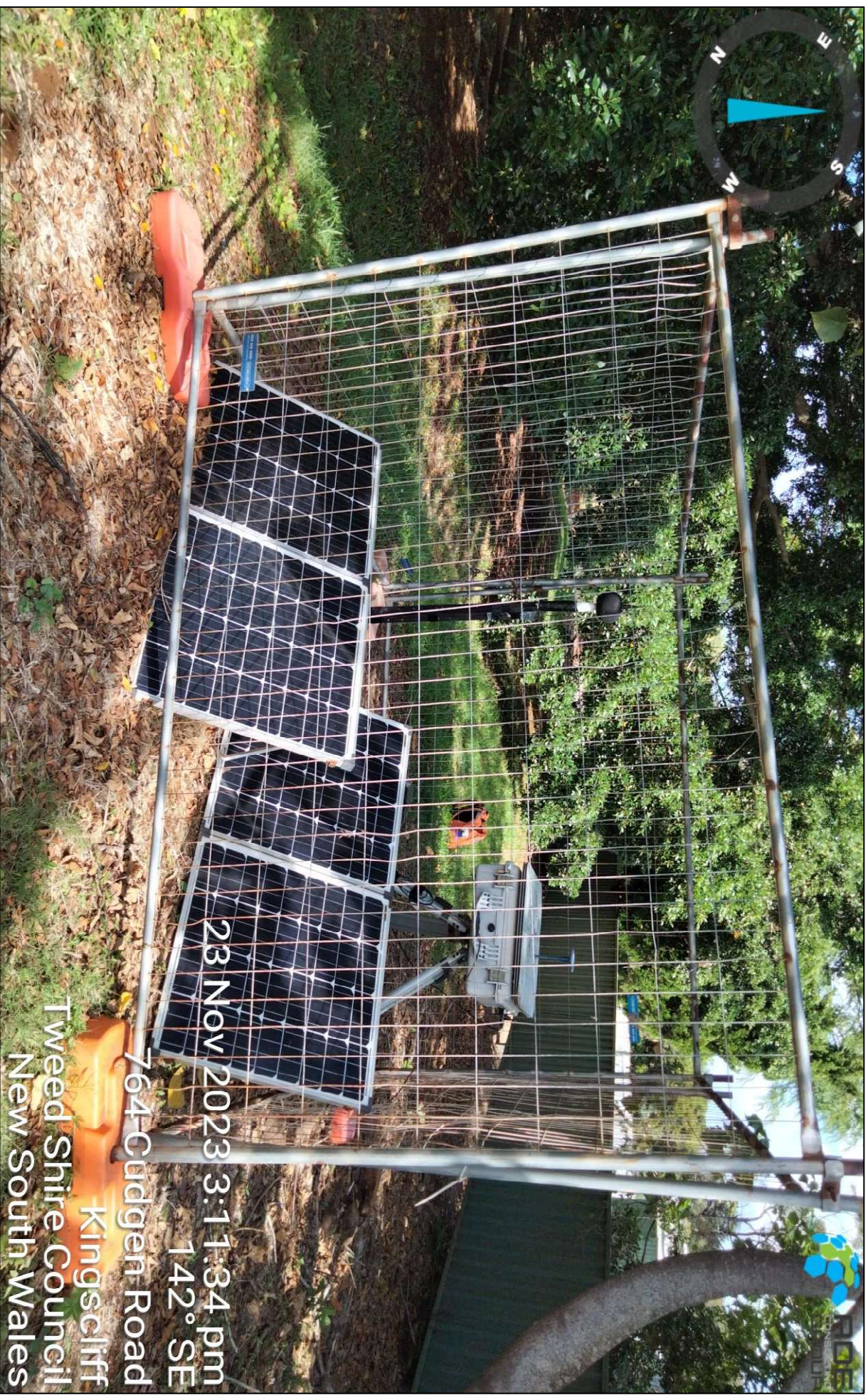
Photograph 1: Representative photograph of monitoring location 005 – Solar Industry, as observed 23/11/2023