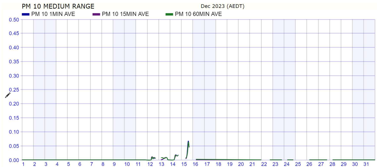
Figure 2. Summary of PM10 from the real time monitoring at location 006 – Mate and Matts for the month of December 2023.